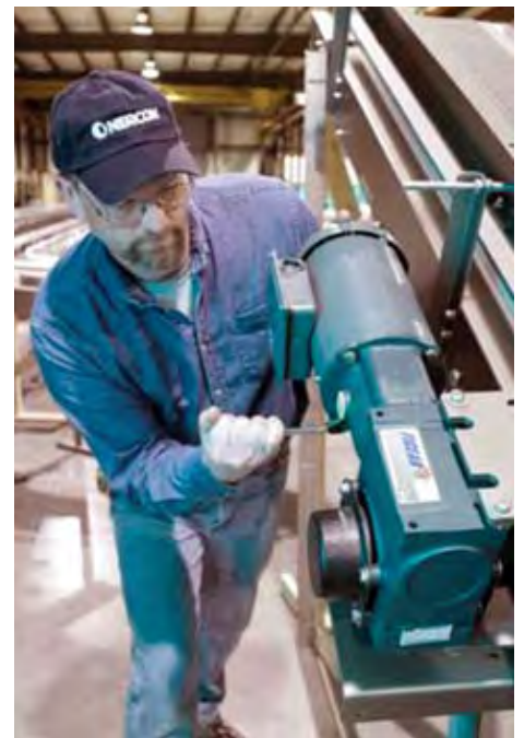
A Nercon employee assembles a Baldor•Reliance motor to a Baldor•Dodge Tigear-2 reducer...a perfect match.