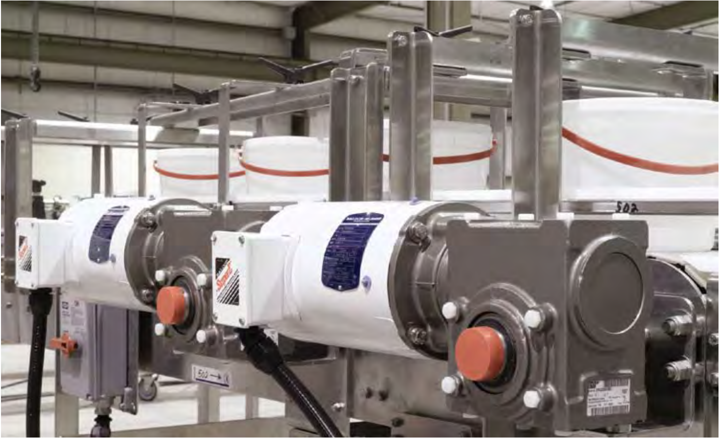
Nercon, an industry-leading high-end conveyor manufacturer has standardized on Baldor products based on a history of quality. Here Baldor•Reliance Super-E® Washdown Duty motors and Baldor•Dodge E-Z Kleen® Tigear-2® reducers were selected for reliability and energy cost savings.

From that humble beginning, Nercon has grown into a full-service engineering company with two large manufacturing facilities located in Wisconsin. It designs and manufactures custom conveyor systems and related material handling equipment, primarily serving Fortune 500 consumer packaged goods companies.